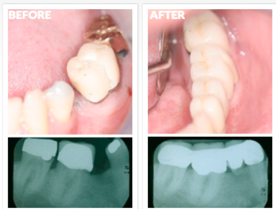
10 Years Following Treatment: No additional bone loss, decay, or food impaction.

Eliminate the guesswork and expose errors with crown and bridgework before they are compounded and compromise the outcome.