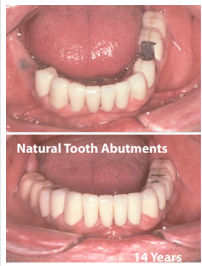
Precision Attachment Case

There are many cases in which implants are clearly the treatment of choice for patients. Many times, however, conventional fixed or removable restorations can offer a much better prognosis for the patient. Learn when it is appropriate to treatment plan for implant restorations and when it is appropriate to treatment plan for restorations on natural teeth. The use of fixed and removable bridgework will be covered for both implant and natural tooth abutments. Cases presented will be drawn from a library of over 100,000 pictures taken during the past 60 years.