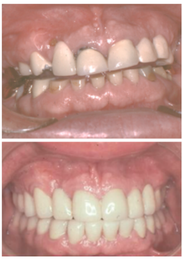
Piecemeal vs. Overall Approach

Learn what to do when you don't know what to do.