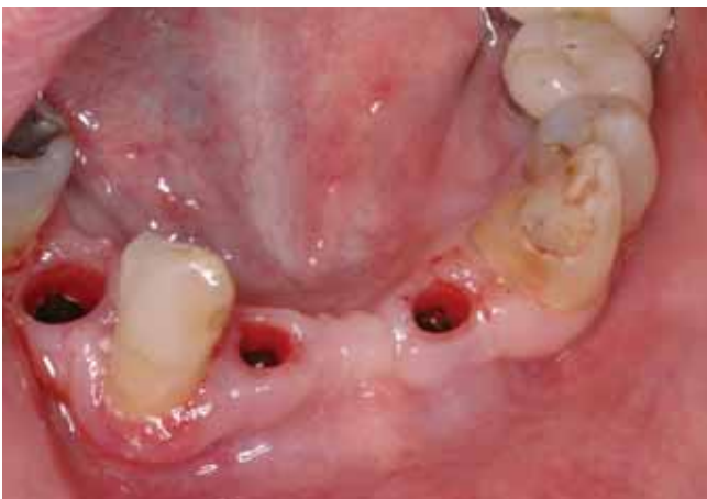
Figure 5 Immediately post-operatively showing the fully exposed implants. The transfer copings can be fully seated without any tissue impingement to insure an accurate impression.