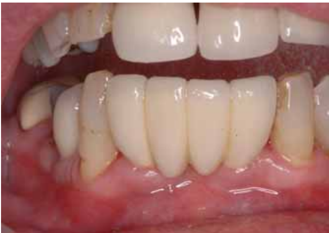
Figure 9 Six month postoperative photo showing healthy tissue healing.

periodontal pack such as COE-PAK (GC America), Zone (Dux Dental), or Barricaid (DENTSPLY Caulk).