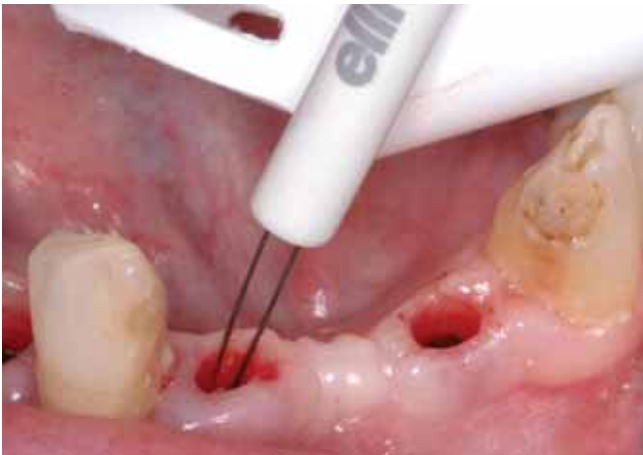
Figure 3 The central suction is placed in close proximity to the surgical site to remove any debris. The bipolar electrode was used to minimize any heat since the radiowave travels only between the two electrode tips.