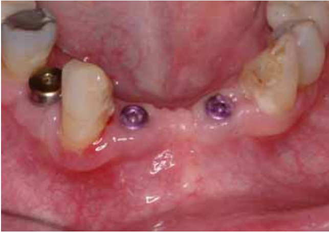
Figure 1 A preoperative view with the three healing caps in position.