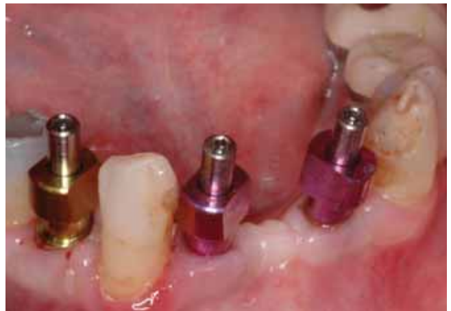
Figure 6 Transfer copings fully seated without any tissue impingement.

trapping section, a HEPA filter for virus removal, as well as a charcoal filter section for odor control. To ensure filtration efficiency, radiofrequency identification technology has been incorporated into the circuitry to monitor the filter function and lifespan.