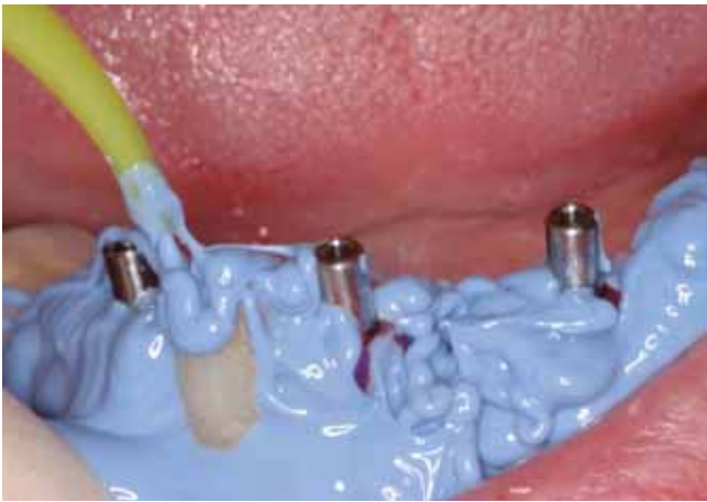
Figure 7 3M Express impression material being injected around the transfer copings.