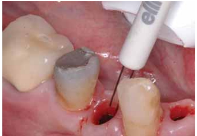
Figure 4 It can be seen that the two tips of the bipolar electrode are parallel to one another. One tip acts as the active electrode and does the cutting while the other acts as the antenna. The radiosignal travels between the two tips.