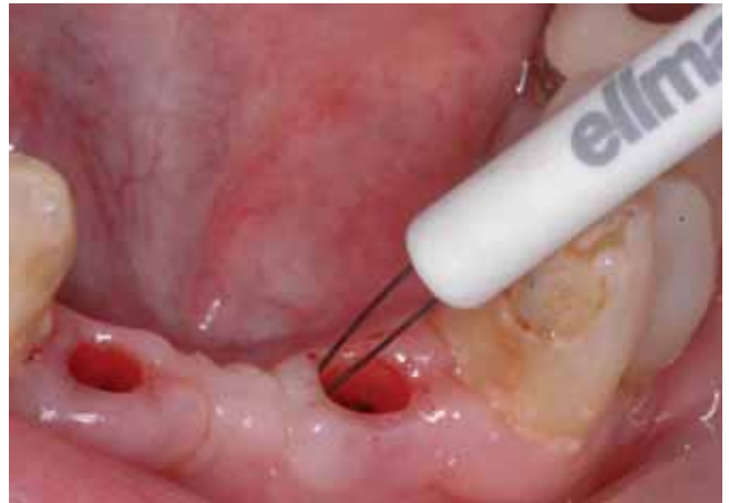
Figure 2 A straight bipolar electrode is used to incise the tissue and expose the implant fully. The Fully Filtered waveform is used to produce the least amount of lateral heat.