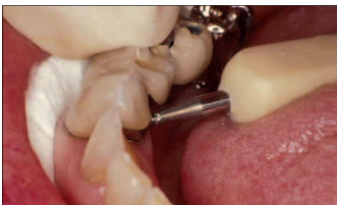
Fig. 8 Intra-oral view of the lingual set screw being tightened on fastening the crown and pontic to the telescopic coping on the tooth.