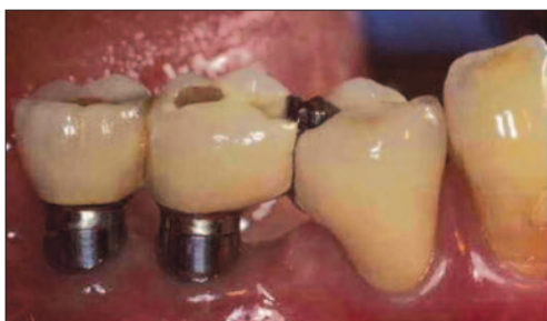
Fig. 2 Another example of intrusion of tooth when connected to implants with non-rigid connector.