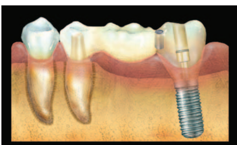
Fig. 11 Diagram of tooth to implant connection with attachment placed between the implant supported restoration and pontic.