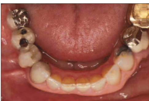
Fig. 9 Occlusal view of restored mandibular arch.