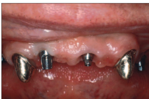
Fig. 5 Intrusion of the tooth with telescopic crown is evident about four months after delivering restorations.