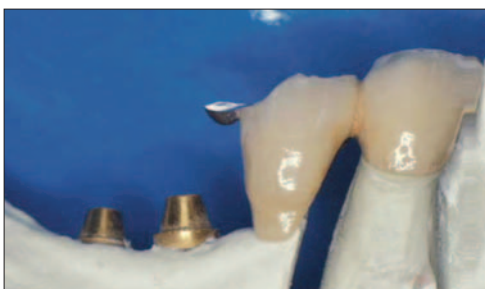
Fig. 7 The case in Figure 6 on the master cast prior to delivery – note the rest attached to the pontic.